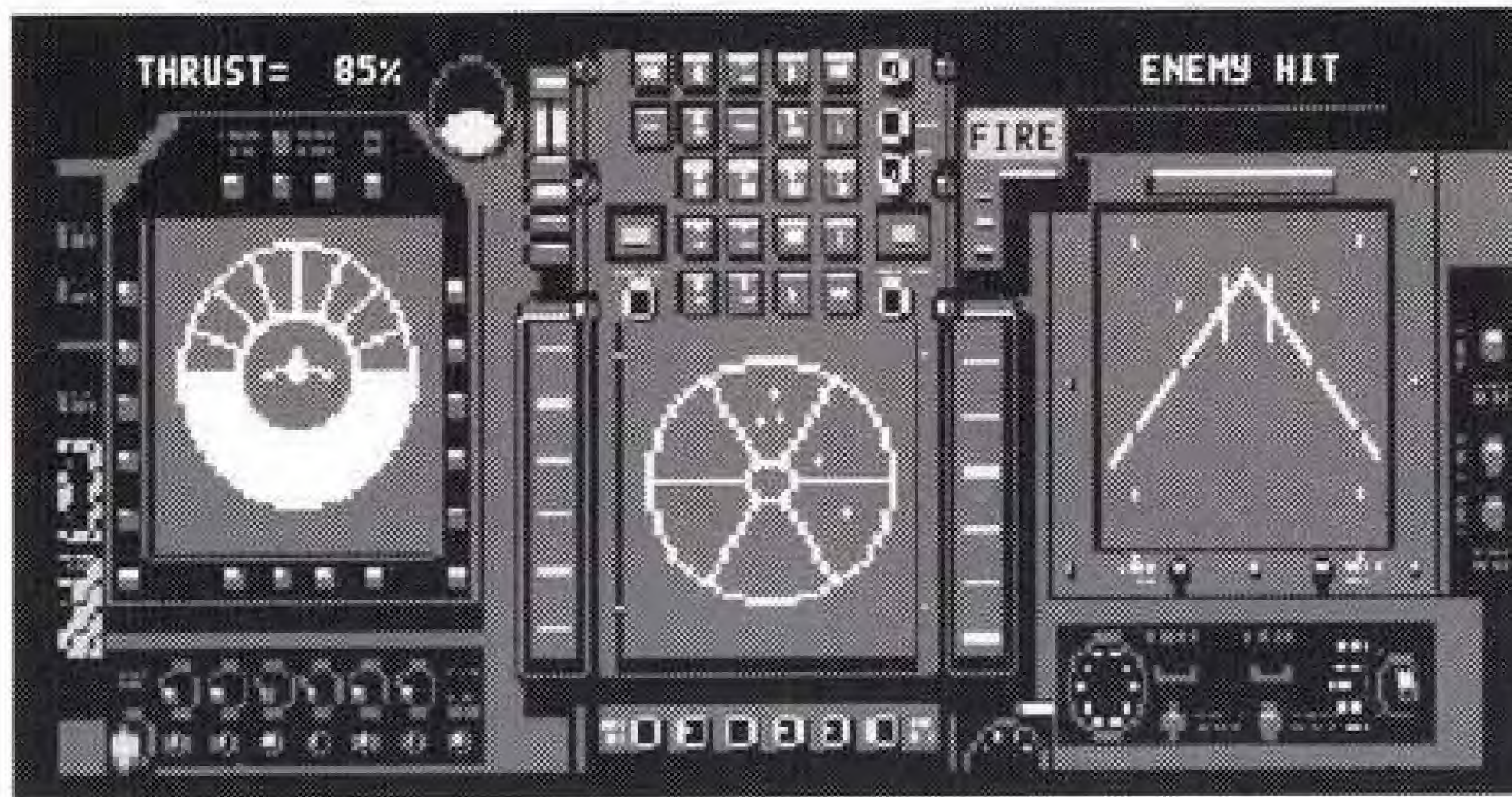
COCKPIT SCREEN (F-4 PHANTOM INTERCEPTOR)

The screen shows the inside of your cockpit when you are flying the Phantom against Mig 21 jets in air-to-air combat. All of the instruments and displays you need are visible.